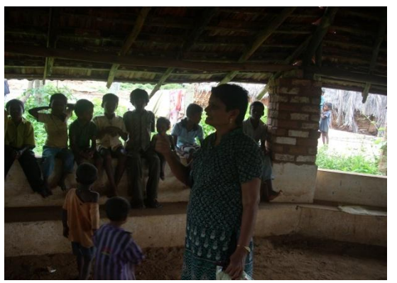
HEALTH TALK AT HAKKI PIKKI