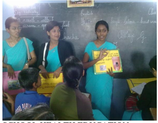
SCHOOL HEALTH EDUCATION COLONY