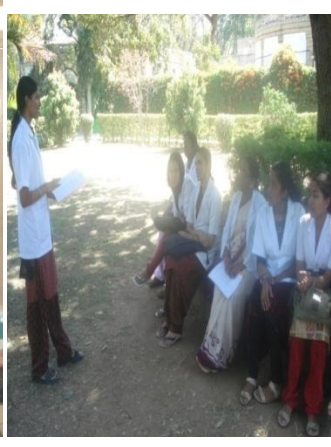
STUDENTS WITH PATIENTS AT NIMHANS